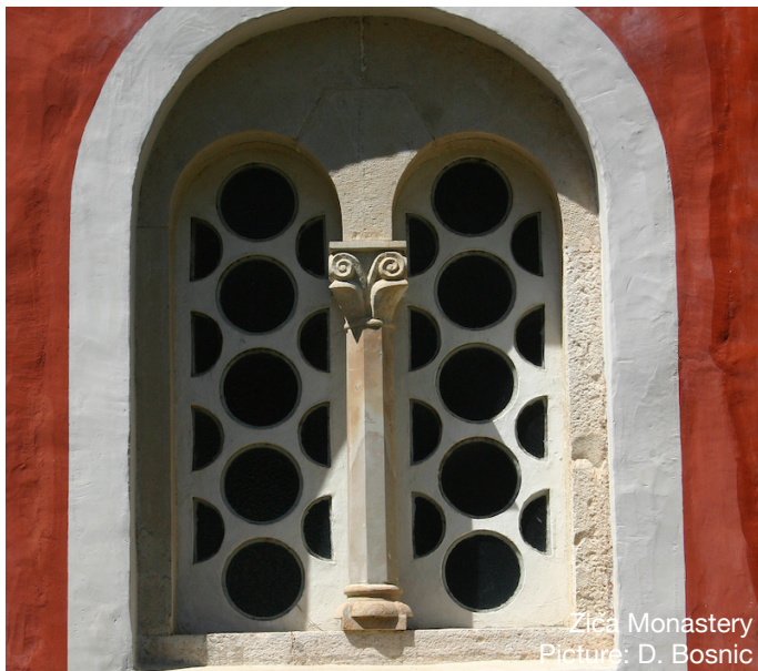
Žiča Monastery

Travel to the village of Rudno on the Golija Mountain. There you can enjoy an overnight stay in houses with traditional architecture and a specific village atmosphere, and dinner with traditional dishes.