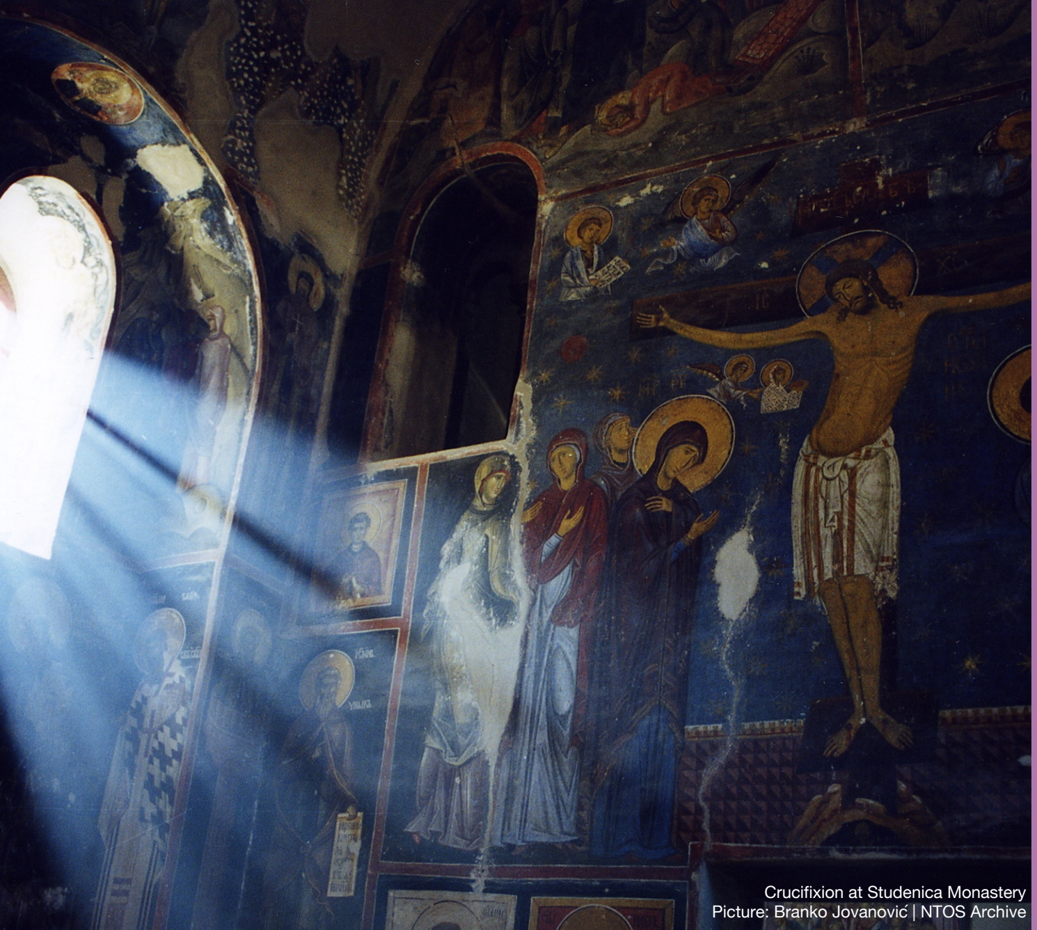
Crucifixion at Studenica Monastery