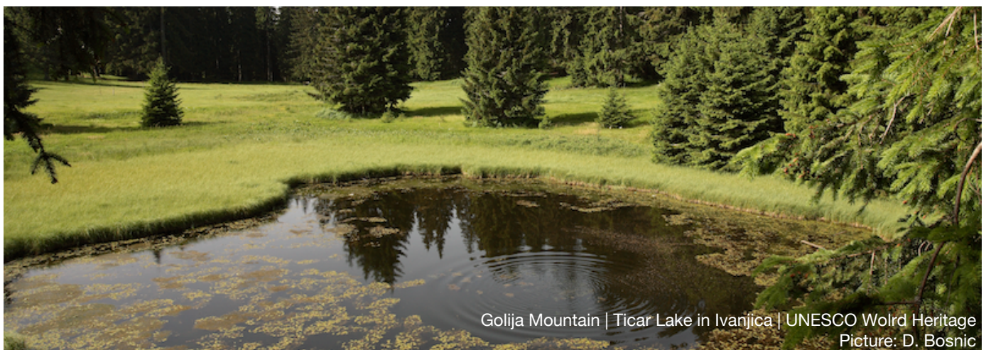
Golija Mountain | Tigar Lake in Ivanjica | UNESCO World Heritage

Lunch at the famous “Etno Kuća Čakmara Restaurant” will keep you in the mood for traditional Serbian food. After a tasty meal, drive on via the town of Kraljevo. Some 30 km south-west of the town lies the medieval fortress Maglič, one of the best-preserved and most beautiful fortifications of medieval Serbia.